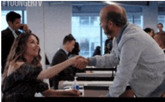
Career Fair or Networking